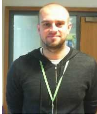
Student Liaison & Enrichment Lead