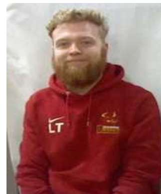
Basketball & Netball Coach