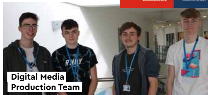
Digital Media Production Team

Fourteen talented students from NWSLC have reached the national finals of WorldSkills UK and will compete this month for the chance to join Team UK on an international stage at the 'Skills Olympics' in Shanghai in 2022. The students will compete among 400 of their peers from all over the UK who will test their skills in over 60 competitions at 25 venues for the chance to win gold, silver, and bronze medals. The medal ceremony will take place on 26 November 2021 as part of Steph McGovern's Channel 4 'Packed Lunch' TV show. NWSLC is proud to have been named as host for the national finals in digital media production and visual merchandising which will take place at its Hinckley Campus.